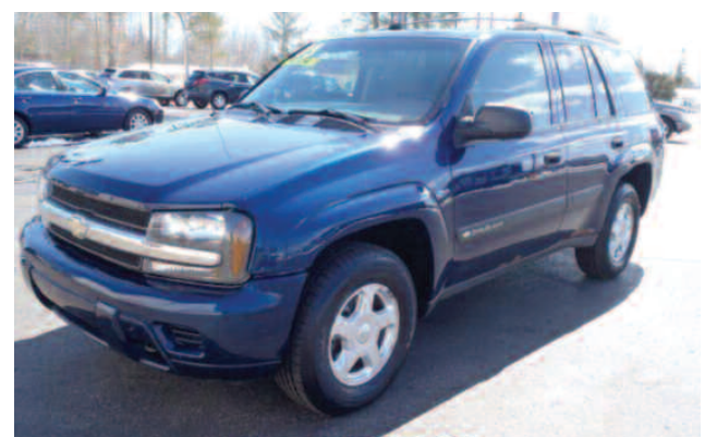
2003 CHEVY TRAILBLAZER