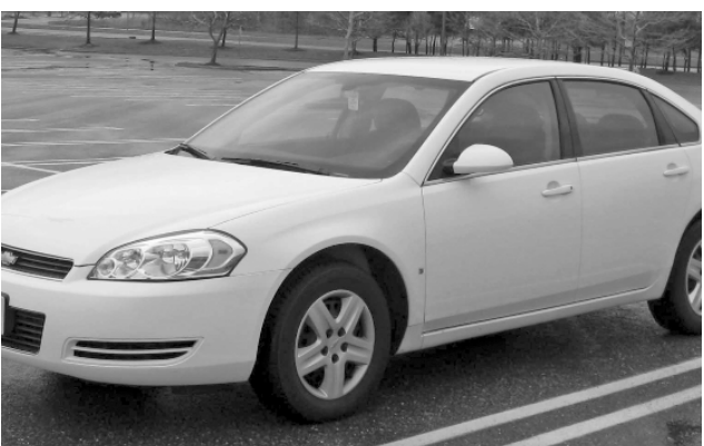
2008 CHEVY IMPALA