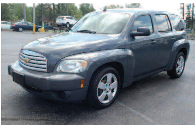
2009 CHEVY HHR