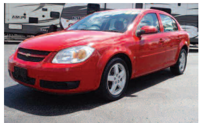
2003 CHEVY COBALT