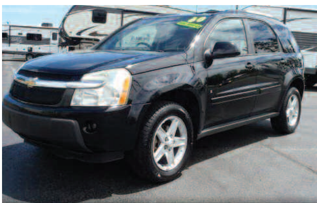
2006 CHEVY EQUINOX