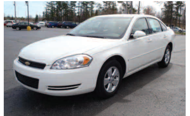
2007 CHEVY IMPALA