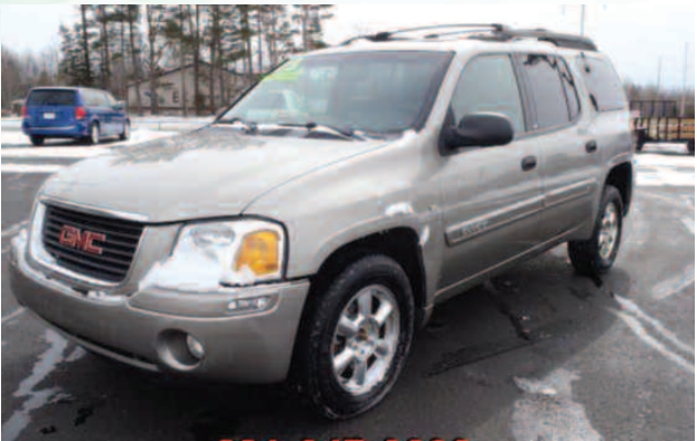
2003 GMC ENVOY 4WD