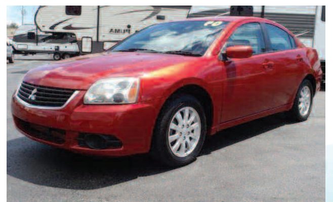
2009 MITSUBISHI GALLANT

EXPERIENCE THE DRIVE NOW DIFFERENCE* FOR YOURSELF A BETTER CAR A BETTER SELECTION BETTER PROTECTION