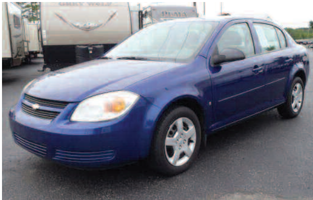
2007 CHEVY COBALT