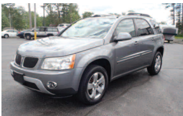
2006 PONTIAC TORRENT