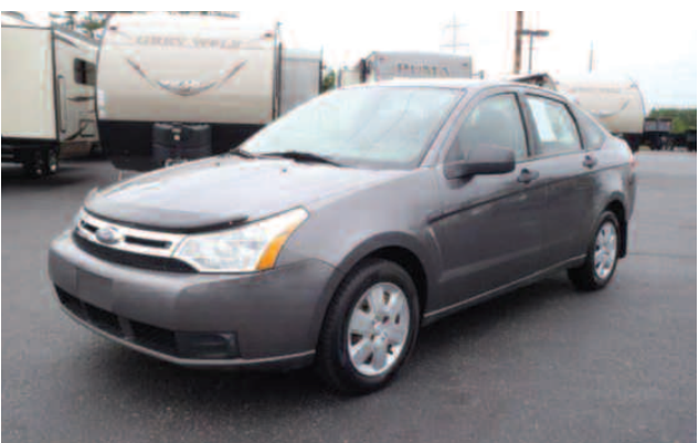
2008 FORD FOCUS