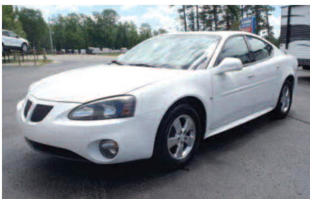
2007 PONTIAC GRAND PRIX