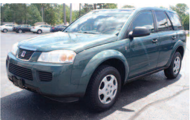
2006 SATURN VUE