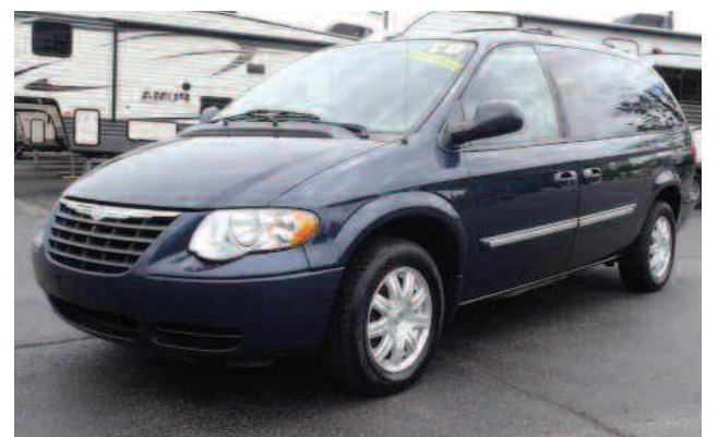
2007 CHRYSLER TOWN & COUNTRY