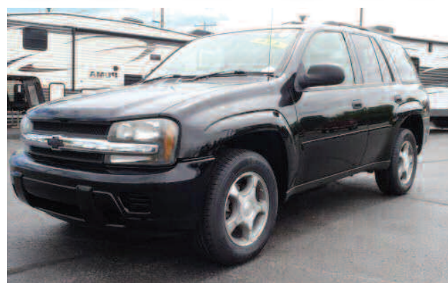
2007 CHEVY TRAILBLAZER